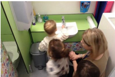
New toilet inspection!