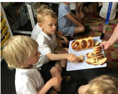
The Infants have been making Challah – an enriched dough eaten on Shabbat.

Amongst the daily life of the school Y6 have been busy visiting their Secondary schools, we have completed the Y4 times tables tests, Y1 phonics, Y2 optional SATs and we've been moderated for Y6 writing. We've also hosted a visit from the School Adviser who, alongside a Governor, monitored the pupil's understanding of the vision and values. The School Council had a meaningful discussion about how to be an 'Agent of Change' and the passion, planning as well as the actions and reflections that we need to engender in the children. Please encourage the Council in their ambition to remove single use plastic from playtimes and lunch times - this will really help them see that they CAN make a CHANGE.