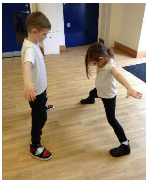
Super paired gymnastic challenge!