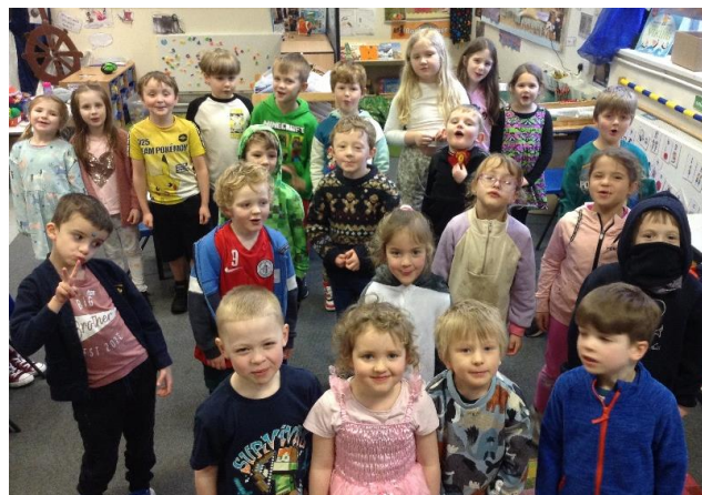
Hedgehogs expressing themselves!

Thank you for your contributions we raised £42 for charity Place2Be.