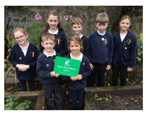
Meet our Eco Warriors for 23-24.

We have again received the Green Flag Award - this is a huge piece of work, led by the staff and involves all the children over two years. When you hear that we are looking into how to reduce our carbon footprint by recycling, reducing plastic waste, cycling/walking to school, turning off lights, insulating the roof space, planting saplings to increase biodiversity, feeding the birds, building hedgehog houses, learning how to cook fresh food, enhancing the play space, supporting our partner school in Burkina Faso or learning how to save water - then it all counts towards being an Eco School. There are 10 areas to cover which we try hard to embed within the curriculum - if anyone wants to be more involved there are lots of opportunities, in particular we'd love a regular grow cook and eat lead!